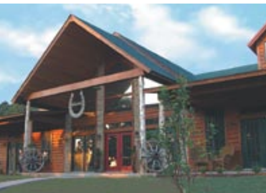
▼ Rusty Gables Guest Lodge and Gallery