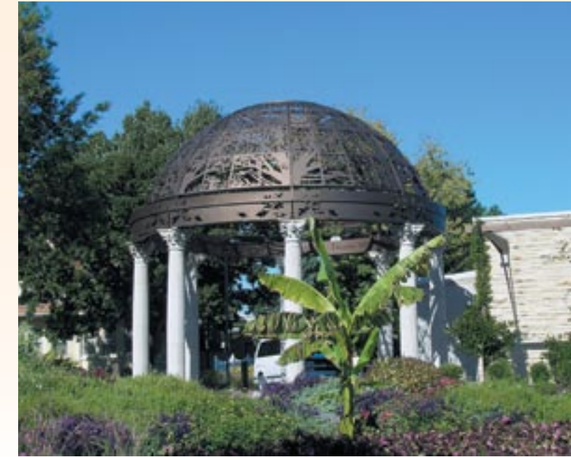
▲ Lincoln's Sunken Gardens

The drive from Fostoria, Iowa to Medicine Park, Oklahoma is 800 miles. There are many other B&B's on the way. Check our directory in the back for listings.