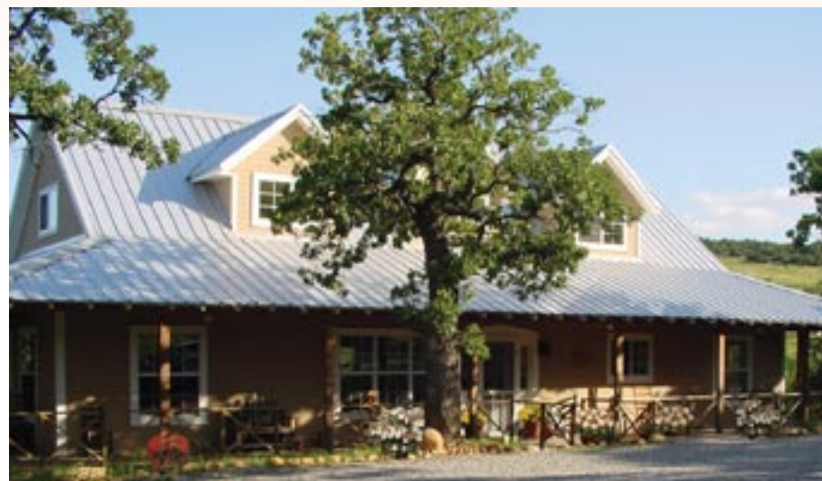
▲ Stardust Inn Bed & Breakfast

The lodge is alive with rustic charm, but in a most elegant manner. The two luxurious suites are a must-see. Both rooms have private outdoor entrances, king-size pillow-top beds, custom bedding and drapes, private baths with oversized Jacuzzi tubs and separate showers, stone fireplaces, refrigerators, microwaves, warm cotton robes and charming bath amenities. All guests at the open house seemed to enjoy the touring of the