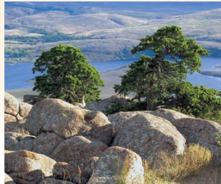
▲ View of Lake Elmer Thomas from the top of Mt. Scott, Wichita Mountains Wildlife Refuge

The cobblestone village of Medicine Park is filled with history, and building after building is constructed with the